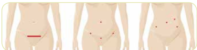
Open Surgery Incision

Your surgeon removes your uterus through a large open incision. The incision must be large enough for his or her hands to fit inside your body and touch your organs.